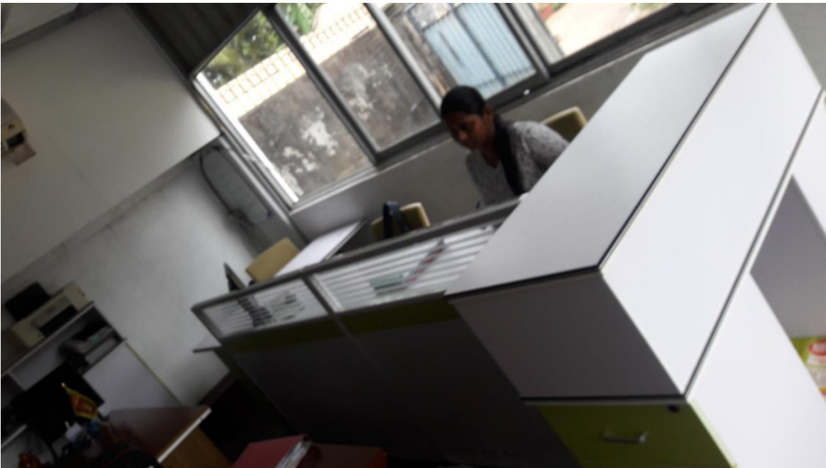
Our offices in workshop premises